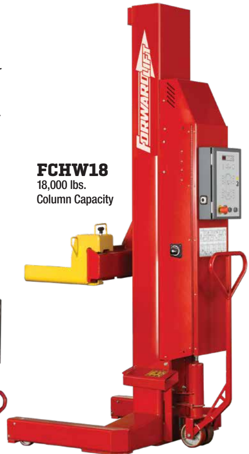
FCHW18 18,000 lbs. Column Capacity